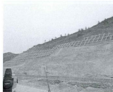
Figure 5. Retaining wall slope on the right side