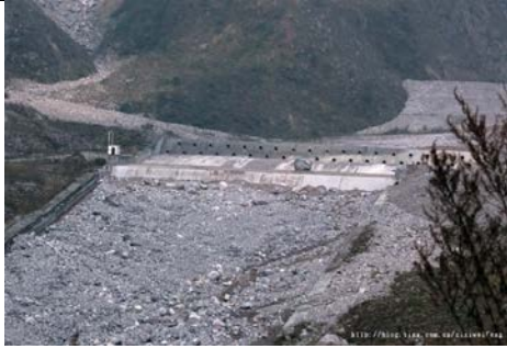
Figure 3. Landslide hazard map2