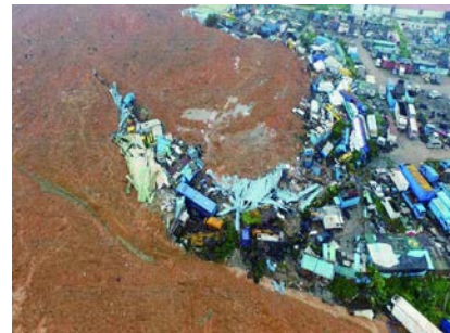
Figure 2. Landslide hazard map1