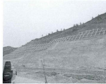
Figure 4. Retaining wall slope on the left side

The surface deformation monitoring with rectangular grid layout, arrangement of four rows along slope toward the direction the surface deformation observation point, 1, 2, 3, 8, 4, 7, a total of 31 points, make the horizontal point parallel to the trend direction, vertical line Parallel to the direction, the horizontal line along the slope to a parallel arrangement. After processing in the slope surface is not found obvious cracks.