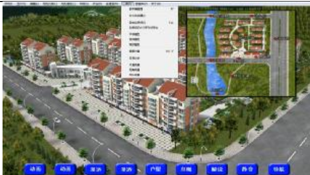
Figure 1. Virtual simulation system of urban planning