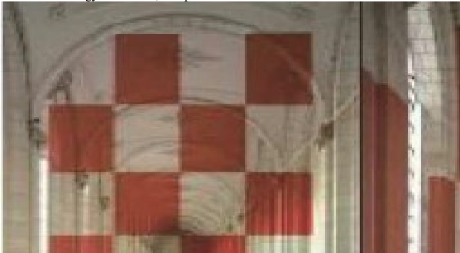
Figure 1. Spatial color contrast

Among the visual elements, color is the most impact and perceptual. However, color must rely on the material as a carrier. At the same time, color can also play a foil role on the texture of the material. Material color can be divided into two kinds: one is natural color, such as natural color of bark, natural texture of wood, and the other is artificial color, such as photographs and pictures. In addition, color also has inherent psychological attributes, it can make people produce different psychological feelings, such as red can bring people warm, exciting, exciting and lively psychological feelings, while green and blue bring people a sense of tranquility and stability, as shown in Figure 1. Color also has symbolic significance, such as white symbolizes sacredness. Green symbolizes peace and yellow symbolizes rights in ancient times. For the creation of graphic design, it is necessary for us to have a full understanding of these attributes of color.